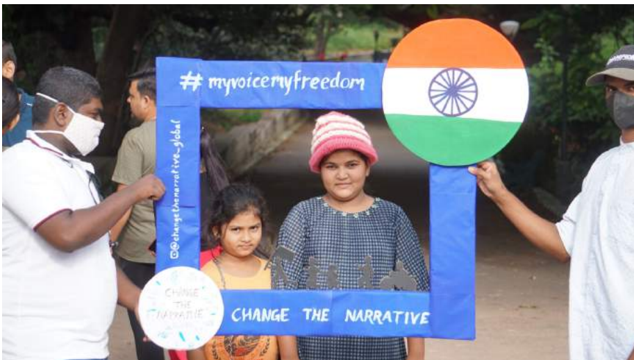
My Voice, My Freedom conducted at Lalbagh